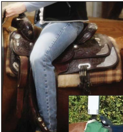
above: Circle Y saddle, hobbles

missing 6.6.08 from 92 Hwy. and Cameron Rd. vicinity, Kearney, Missouri