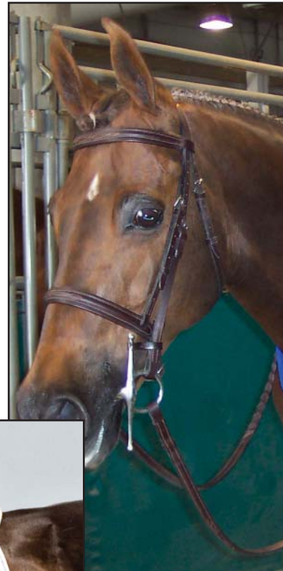
above: Dover Wellington Saratoga bridle, matching raised reins