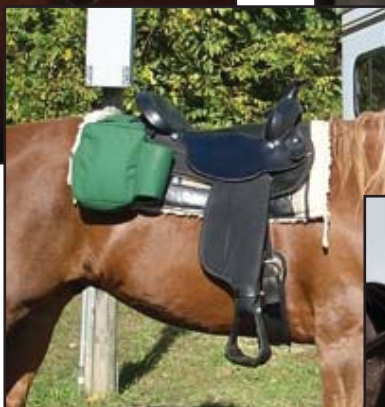
above: Fabtron saddle (saddle bag was not attached when stolen)