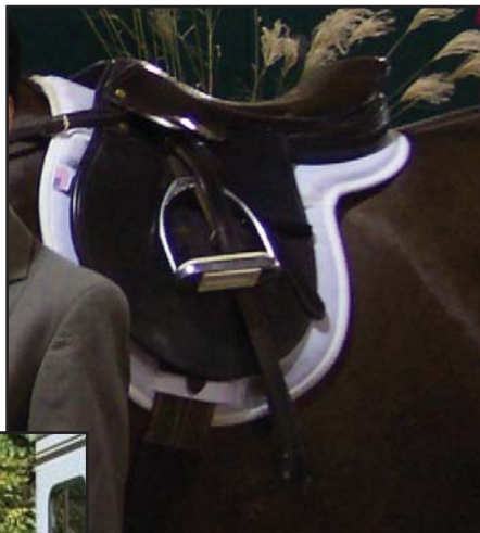
above: Blue Ribbon close contact, Professionals' Choice pad underneath also stolen